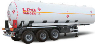
45m 3 LPG Tanker