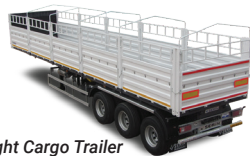
lightweight Cargo Trailer