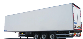
Refridgerated Box Trailer