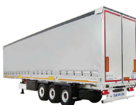
Curtain Side Cargo Trailer