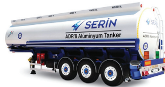
50 000L Aluminium Fuel Tanker