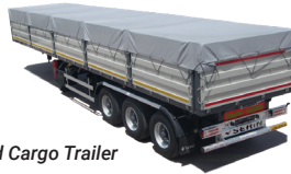
Standard Cargo Trailer