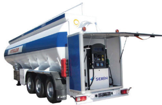
Mobile Fuel Tanker