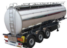
Food Grade 316L Stainless Steel Tanker