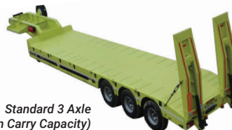
Standard 3 Axle (54 - 66 Ton Carry Capacity)