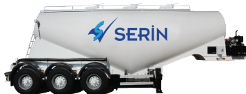
Dry Bulk Cement Tanker