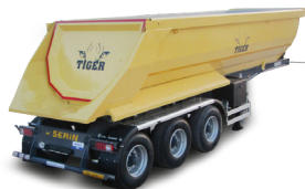
Tiger Half Pipe Tipper