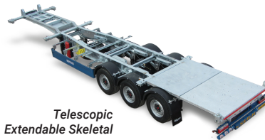
Telescopic Extendable Skeletal