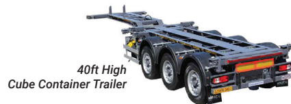
40ft High Cube Container Trailer